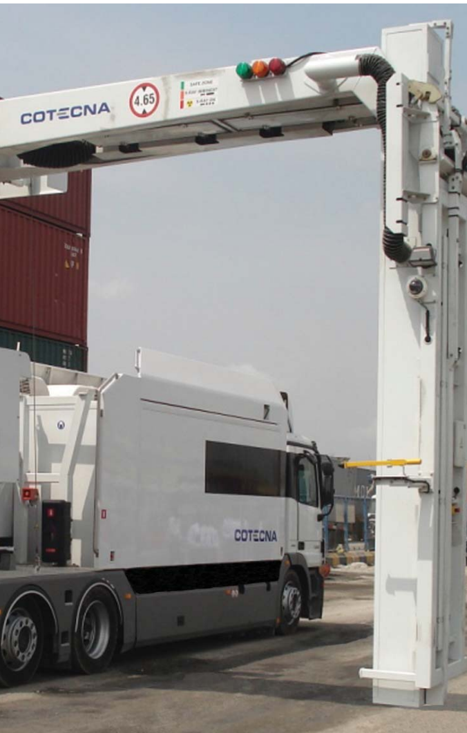
Mobile scanner in operation

Moreover, the use of scanning solutions is fully in line with the requirements of prevailing regulations and guidelines such as the WCO 'SAFE Framework of Standards' to Secure and Facilitate Global Trade or U.S. Regulations.