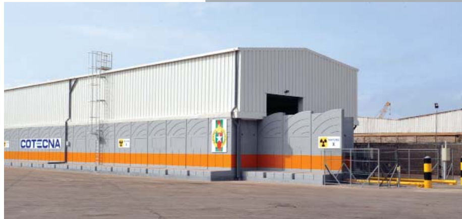
Gantry relocatable scanning facility

With strong revenue growth over the past 10 years, the Cotecna group has a combined workforce of 4 000 employees and agents in close to 100 offices around the world. Our tried and tested experience is drawn from over 35 contracts in government inspection services.