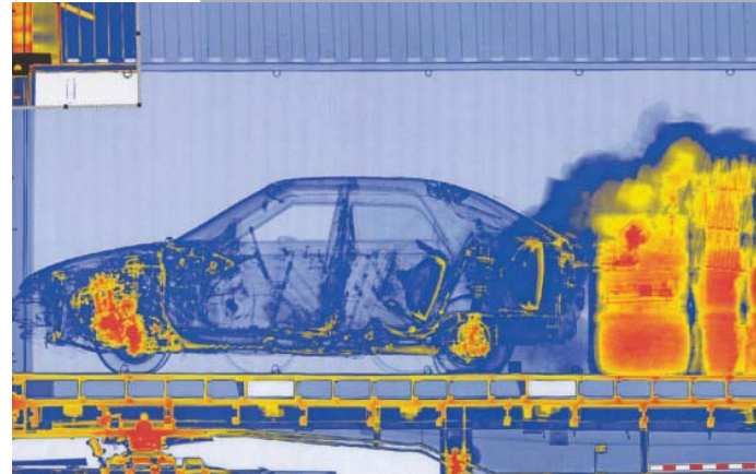
Radioscopic image Car hidden in a container