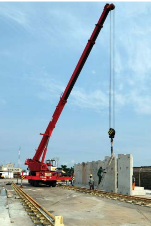
Gantry scanner under construction

Turn-key cargo scanning projects usually take the form of a BOT (Build-Operate-Transfer) or a concession contract according to the following stages: